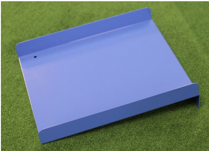
Ramp 12"L x 9 ½" W x 3"H