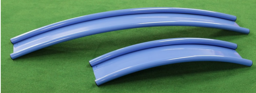
8' Bridge 5' Bridge 3' Bridge