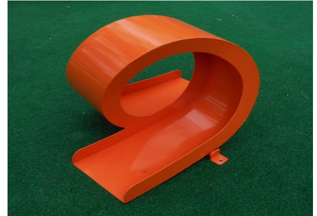
Loop de Loop 24 3 / 8 " W x 26"H