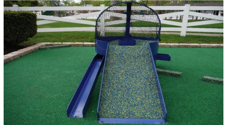
Return To Me 76" L x 23" W