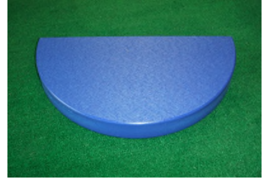
Half Round 18" L x 9" W