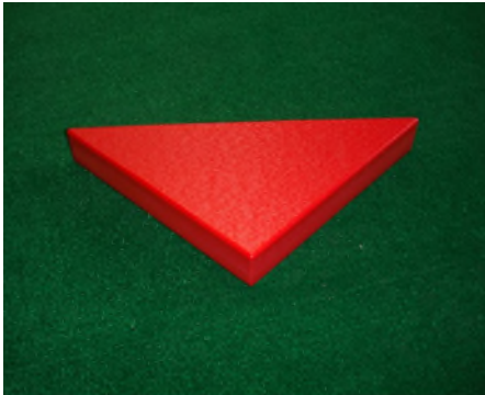
Small Triangle 15 ½"L x 6" H