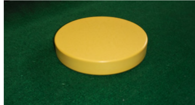
Cylinder 9" Diameter