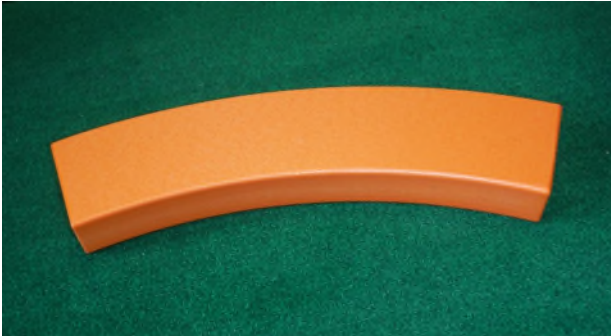
Curved Bar 17 ¾" L