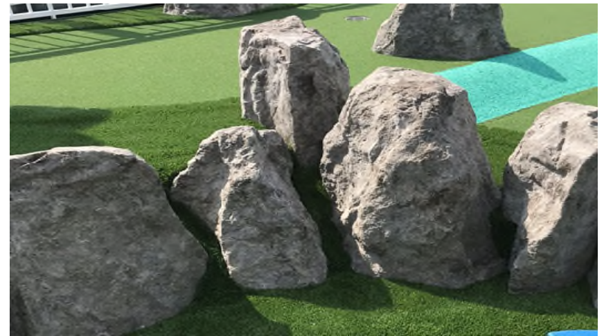
Custom Faux Rocks – Pricing upon request