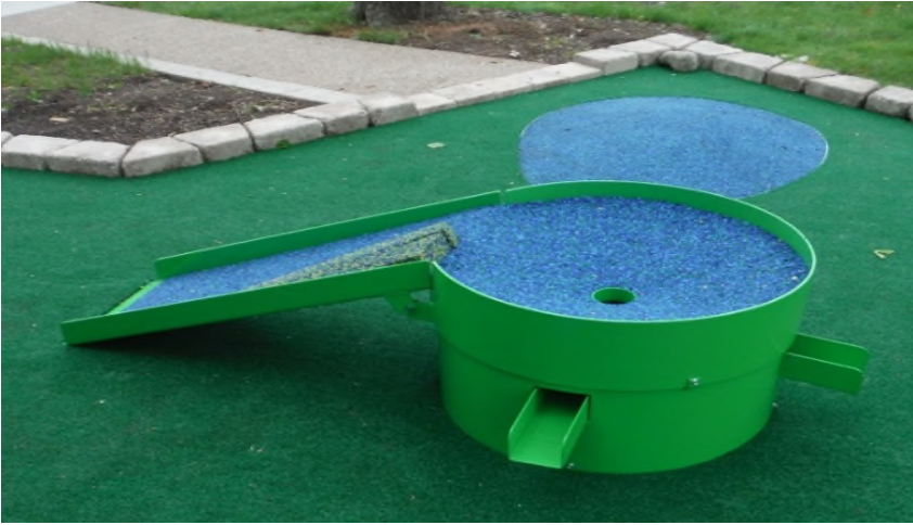
Vortex 98 ¾" L x 14" W x 16"