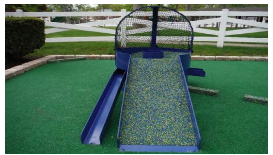
Vortex $3,319 98 ¾" L x 14" W x 16"