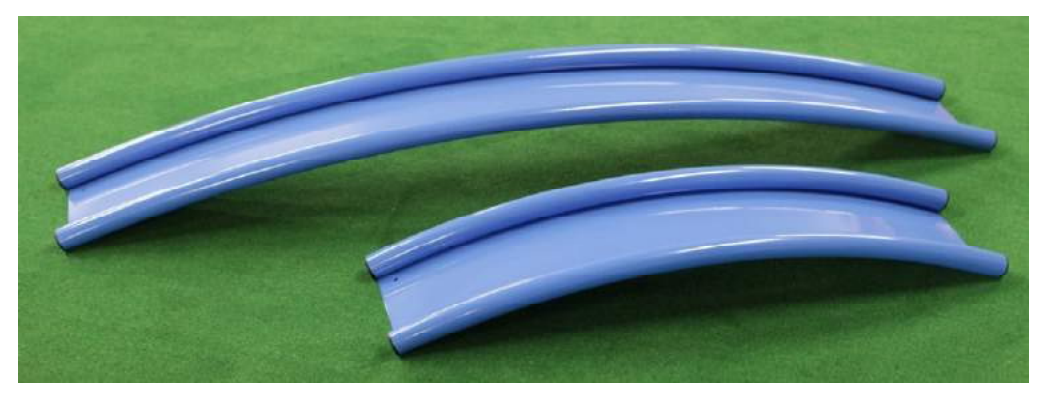
8' Bridge: $453 5' Bridge: $339 3' Bridge: $247