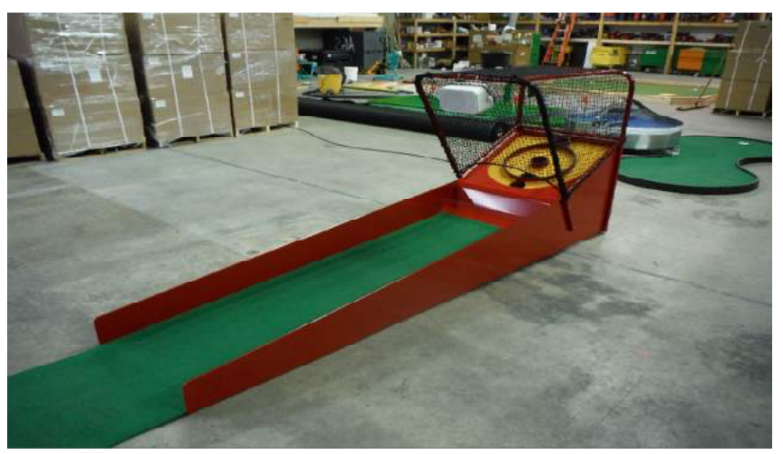
Skeeball : Contact for size and pricing